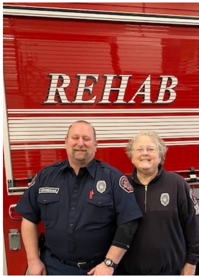
Henry & Judy Henneman Rehab Unit