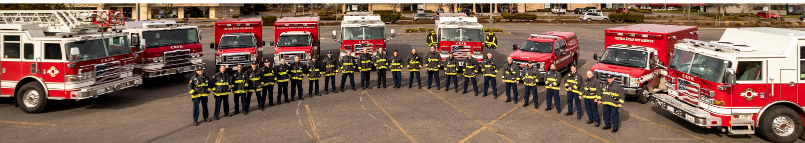
Pictured: CKFR B-Shift Battalion photo taken March 2022.

This is the Kitsap Fire Academy Wolfpack.