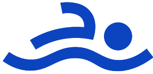
Pictured: Rescue Swimmer Drills at the Kitsap Tennis & Athletic Center!