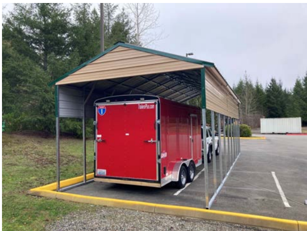
Off-Road Vehicle Storage

Additionally the facilities team recently completed its metal carport project to store the district's off-road vehicle and trailer, and the district's Draft Commander. Great work to everyone involved!