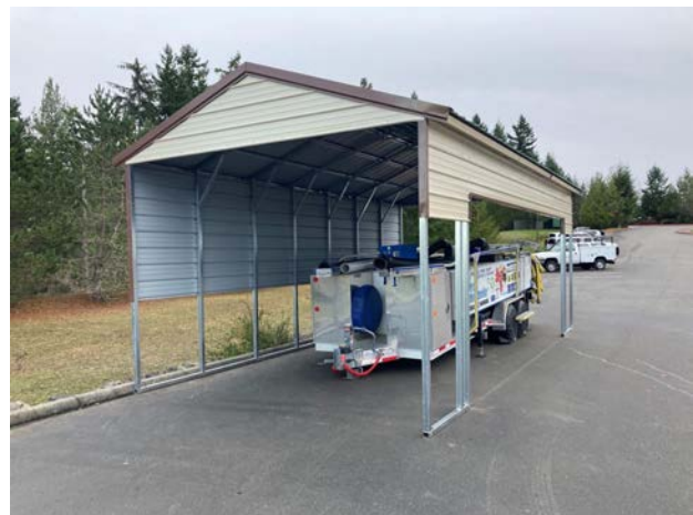
Draft Commander Storage