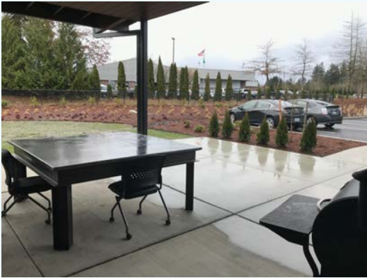
BBQ Patio (off of the Kitchen)