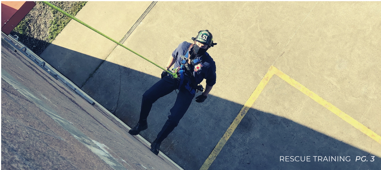
RESCUE TRAINING PG. 3