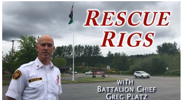
Episode 2: Ladder 51