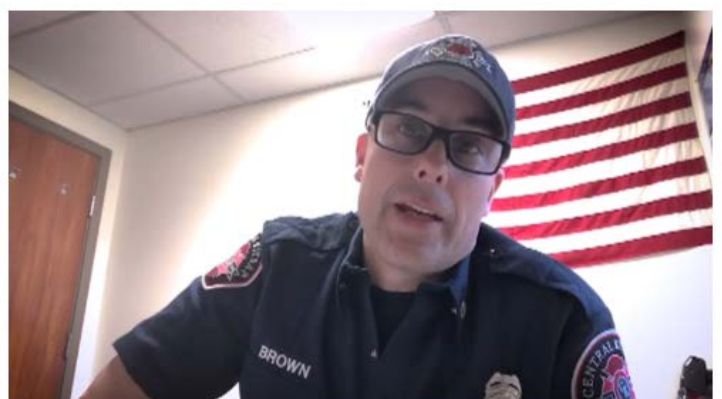
Peer Support Best Practices To Help Reduce Stress