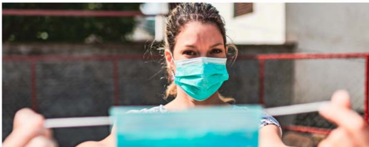
Dental Visit COVID 19 Update

As of May 18, 2020, Washington State dental offices have been allowed to resume regular appointments. Be sure to check with your local dentist as they are the most reliable source of information regarding their office re-opening and hours of operation.