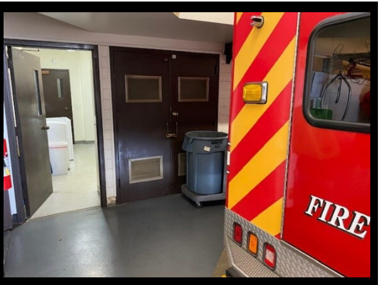
Fire apparatus is located near where firefighters wash their gear, and releases diesel exhaust fumes as they are dispatched to calls.

Some of the District's 60-year old stations lack effective diesel exhaust removal systems and decontamination areas to reduce firefighter exposure to carcinogens and infectious diseases.