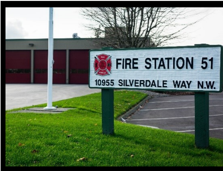
Station 51 in Silverdale is one of the busiest fire stations for the District.