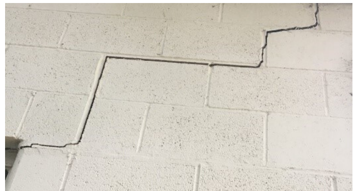
Station 52 is on a dead-end road. It has a large crack in its back wall due to soil and site erosion.