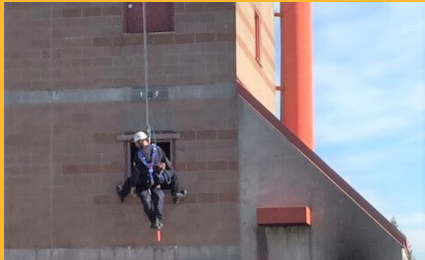
Regular monthly tech rescue drill at Bremerton Training Center. 20 people form 7 agencies.

CKFR had 7 members and R64, practicing high angle rope rescue techniques. Rescues were performed from a patient litter and single rescuer.