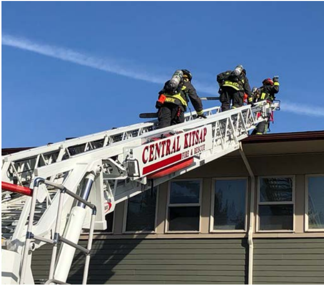
Nothing like clear blue sky in February to practice some Ladder Operations! A-shift Captain Sullivan, FF Werlech and FF Monroe to the roof!