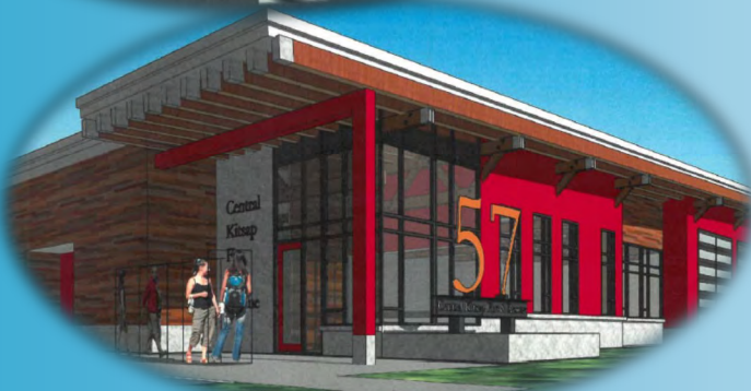
Pictured above are prototypes only.