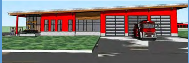
Station 57 Prototype

Architect's rendering of Station 57 that will serve the areas Lake Tahuyeh, Lake Symington, Wildcat Lake, Hintzville, Crosby and Holly.