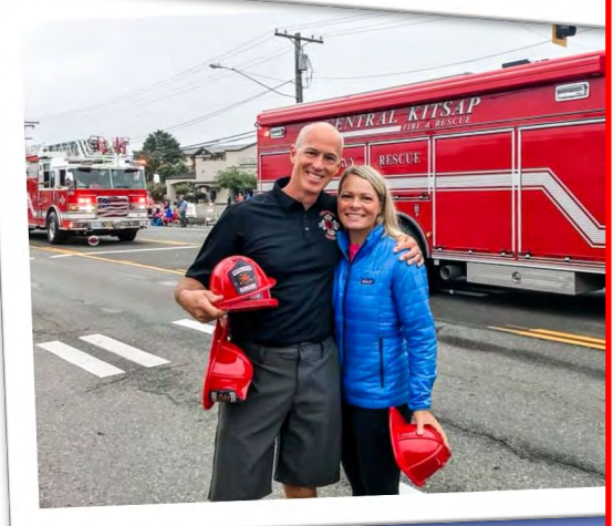
Whaling Days Cont. A huge thanks to all of our parade walkers who participated!