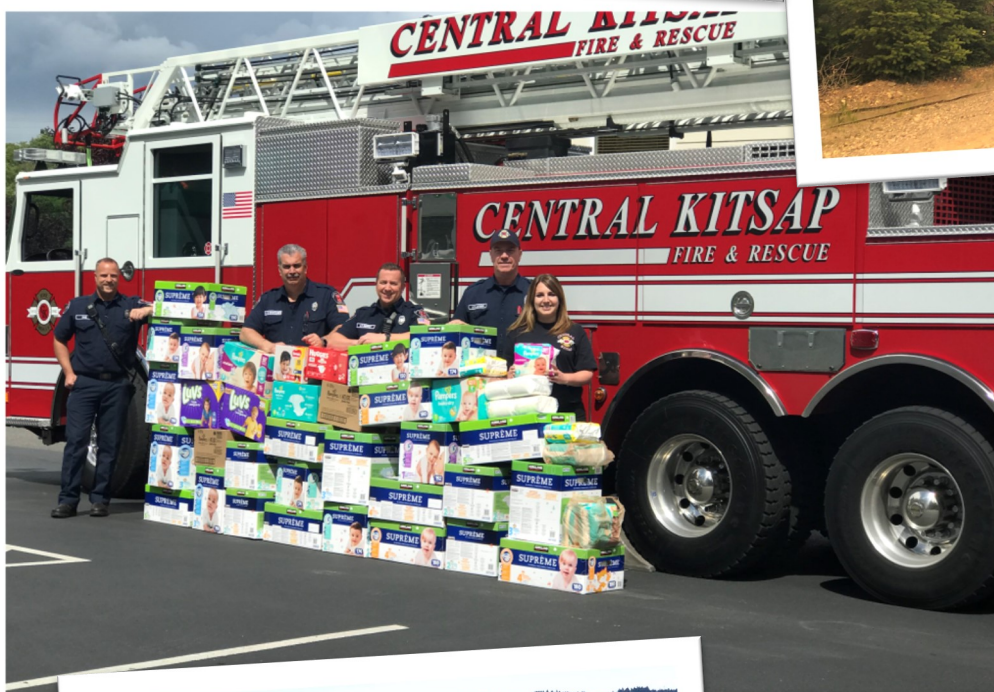
LEFT: Diaper Derby Results: 5,543 diapers and 152 pull-ups!