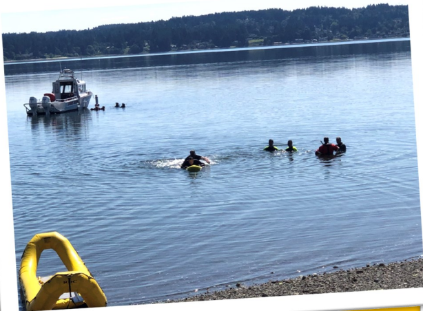
ABOVE/RIGHT: On a beautiful Monday morning, CKFR and Bremerton Fire rescue swimmers gathered for joint training. The teams practiced search techniques, rescue scenarios and patient packaging.