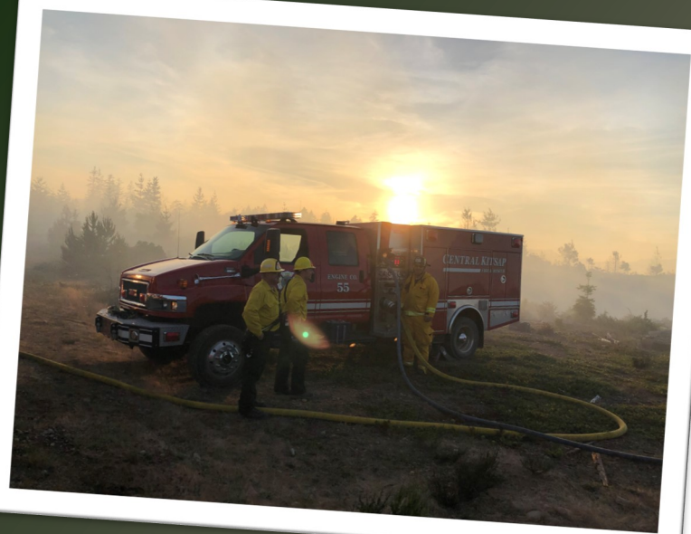
LEFT/BELOW: More shots from the Tahuyah brush fire this week.