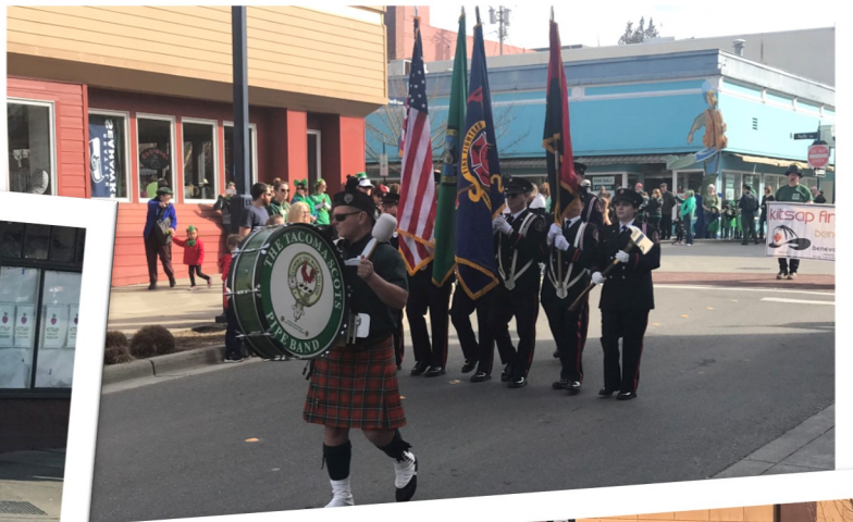
RIGHT/BELOW: More from the Bremerton's St. Patrick's Day Parade on Saturday.