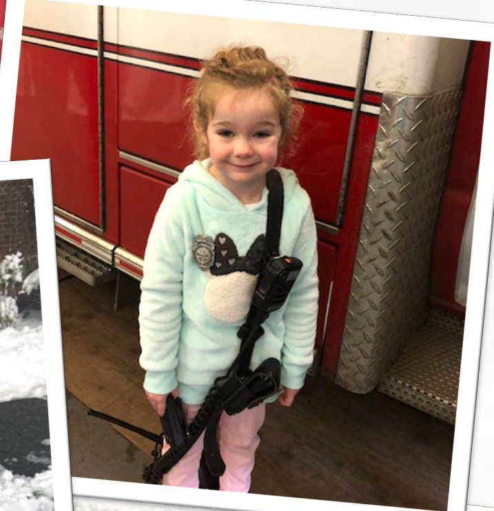
BELOW: PM Chamberlain's daughter, Libby, refused to do a shift trade with PM McCracken for the snow day.