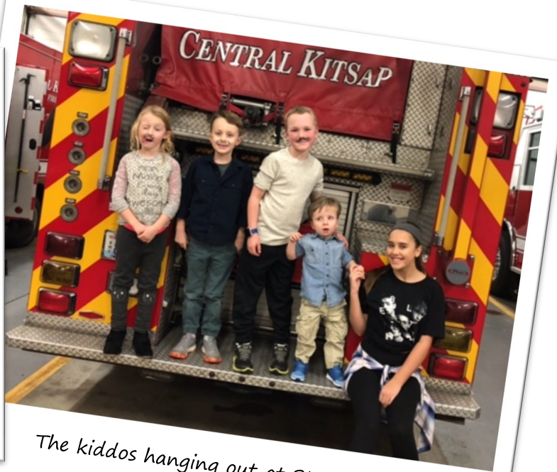
The kiddos hanging out at Station 51 on Christmas Eve!