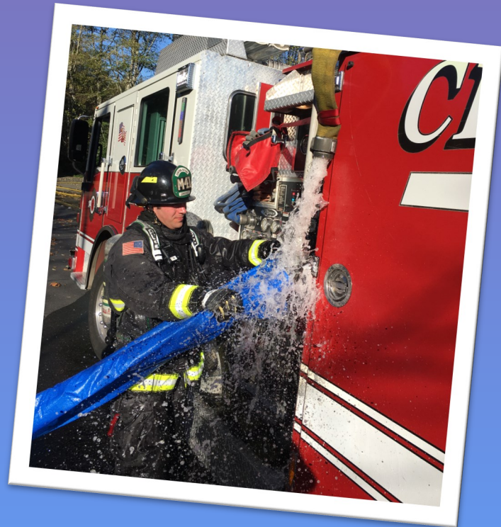
BELOW: Our new Draft Commander 3000 has arrived!