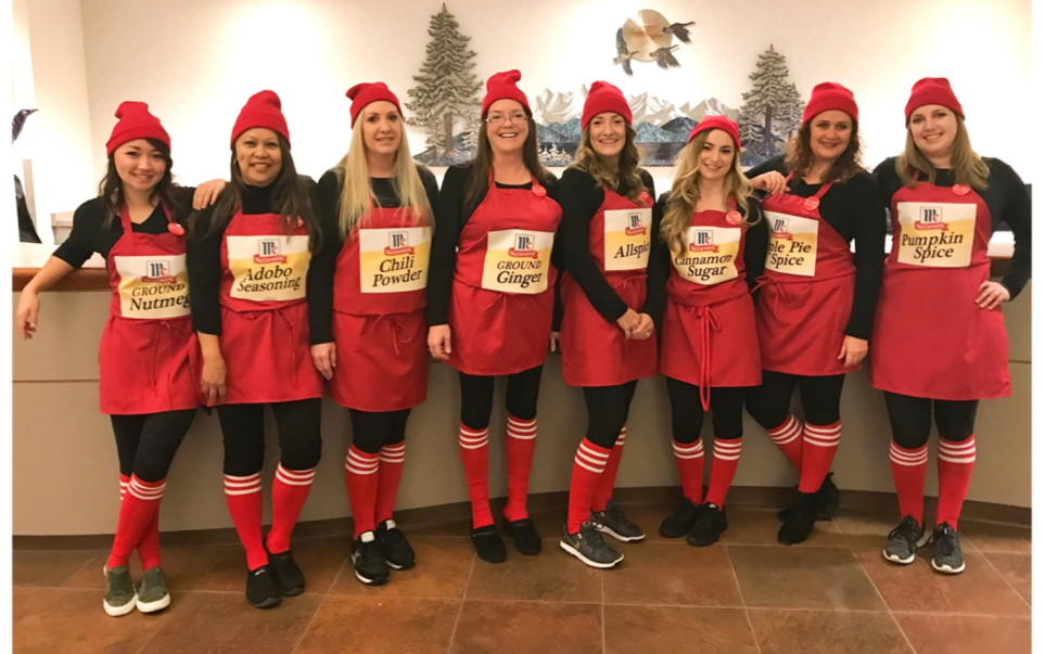
LEFT: The women of CKFR's Admin Staff came together and dressed as none other than the Spice Girls! SPICE UP YOUR LIFE!