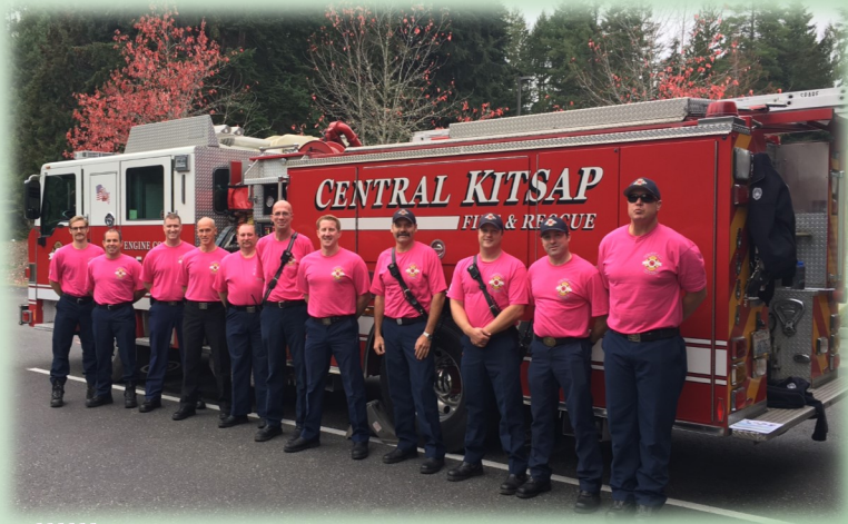
^ A Shift showing their pink pride!