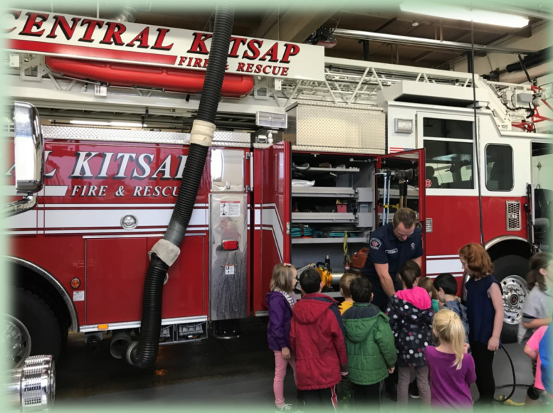
Paramedic Bresnan conducts a tour at Station 51. ✓