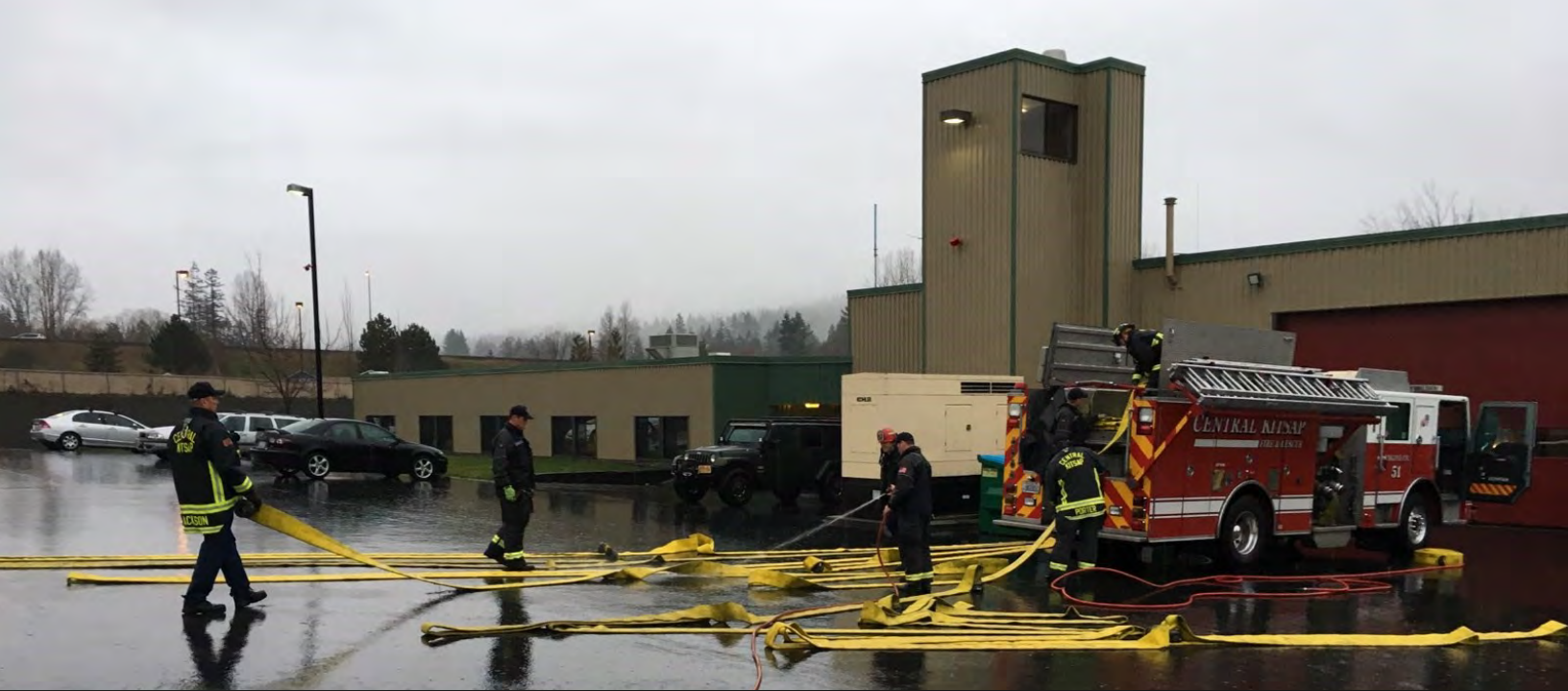
C-Shift crews cleaning and reloading 800 feet of 4-inch supply hose following a fire off of Hwy 303.