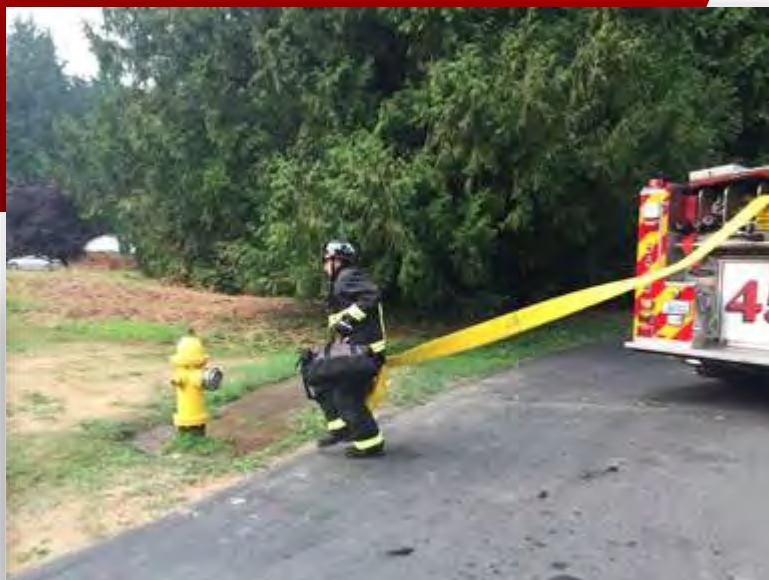
#1 (above): PFF Horner pulls 4" supply from E45 and advances toward hydrant.