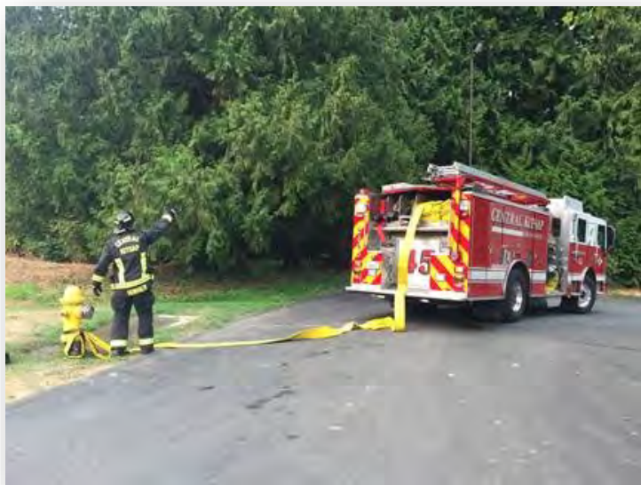
#2 (above): PFF Horner signals for E45 to "DRIVE!"

Pictured is A-shift Probationary Firefighter Tyler Horner on the drill ground with E41, E45 and M41. Evolutions included wet forward hydrant and preconnect attack.